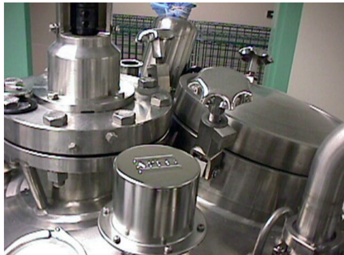
Fig. 1: SoClean® transmitter

No other technology offers better accuracy under harsh conditions than magnetostrictive technology. The SoClean® level transmitter is immune to the effects of foaming, misting, steam, condensation, and agitation. Temposonics level sensors are also not affected by changes in dielectric constant as liquids change during a mixing process. The secret to the success is that the sensing element for magnetostrictive technology is isolated from the process inside of the pipe and this allows for better performance in harsh applications. Stop wasting time and money on recalibrating and recommissioning the wrong level technology. Move to a better product and the SoClean level transmitter for Bioreactors, CIP tanks, and other applications.