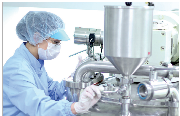
Fig. 2: CIP Tank

The details of the processes in bioreactors is proprietary to each company but the general process of mixing different chemicals is understood. In order to achieve the correct vaccine, medicine, or compound the accuracy requirements are extreme. The SoClean level transmitter can meet these requirements with its inherent +/- 1 measurement accuracy even under harsh conditions. The measurement accuracy does not change due to foam, shifts in dielectric constants, or agitation which are all common in a bioreactor. The proven performance of the SoClean level transmitter and its hygienic design have allowed for validated installation in numerous bioreactors.